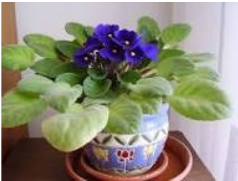
A collection of 5 plants from the Gesneriaceae family