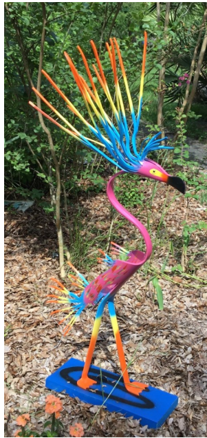
53" Tall Yard Art from PVC Pipe