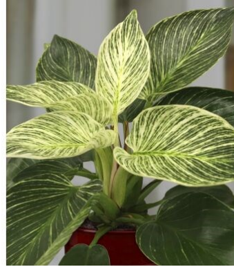
A collection of 5 plants from the Philodendron family