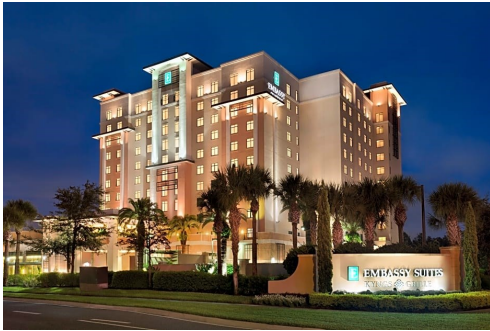
2 nights stay at Embassy Suites Lake Buena Vista South **exclusions apply **