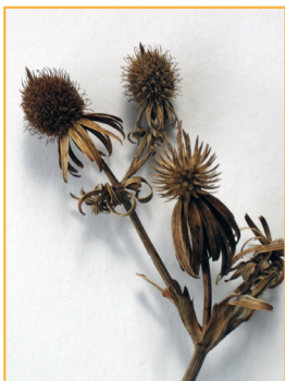
Eryngium seeds (mericarps) encased in a schizocarp

Seeds on the same plant may ripen gradually over time, but placing them in a paper bag will allow for additional ripening of greenish seed. It also will help dry seeds for longer storage.