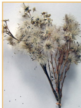
Vernonia seeds (achenes)