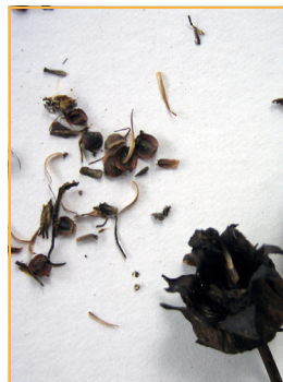
Coreopsis lanceolata seeds (achenes) and seedhead