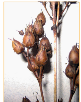
Penstemon seed capsules