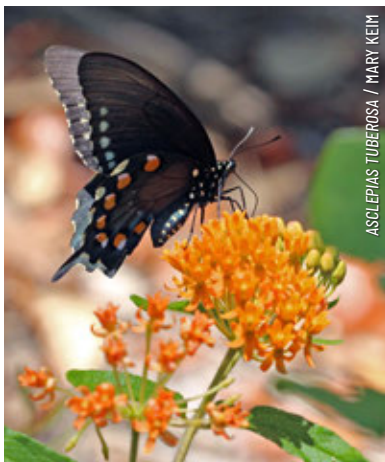
ASCLEPIAS TUBEROSA

For more about shade, download our Great Wildflowers for Shade handout.