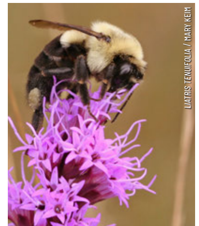
Liatris tenuifolia