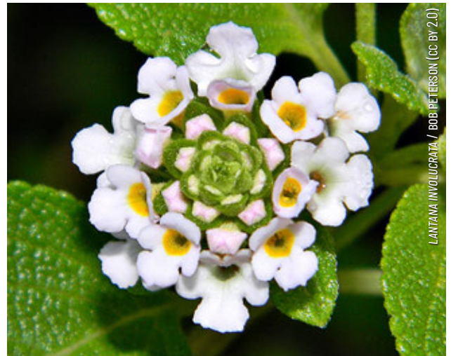
LANTANA INVOLUCRATA

Many wildflowers spread from seed, so time pruning until after seeds mature and scatter.