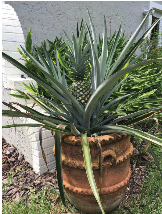
Figure 2. Container-grown pineapple plant in the home landscape.

tie the stalk to a stake to prevent it from falling over. See the section on care of pineapple plants for further information.